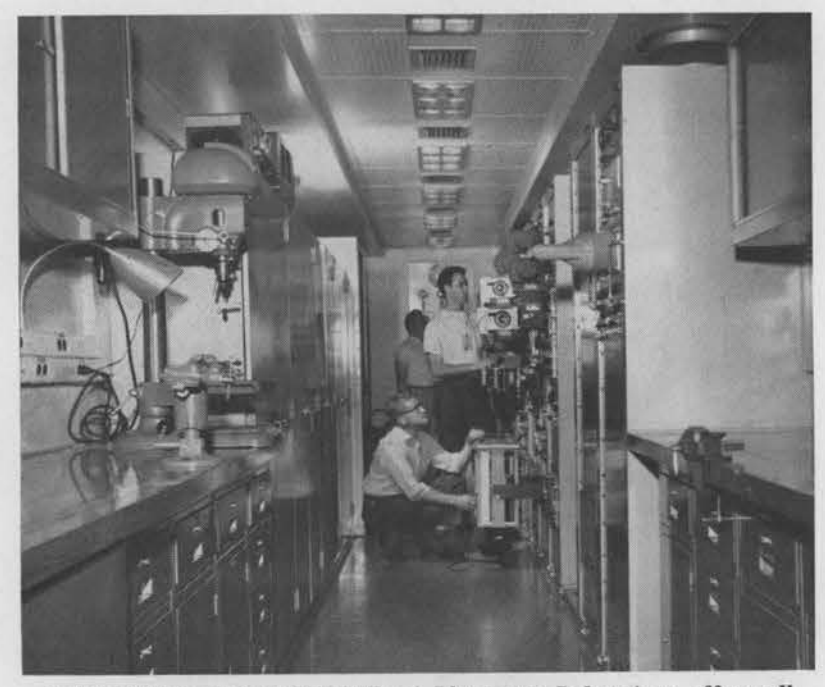
NEW FIELD TEST TRAILER at Livermore Laboratory offers all the comforts of home plus the latest in instrumentation equipment. The 40-foot trailer is equipped with air conditioning, refrigerators, telephones, electric lights, work bench, power tools, radio receivers, and microwave telemetry instrumentation. Checking equipment for use by the Nuclear Support Section (8123-2) are (front to rear) Stewart Ingham, Jim Blanchard, Dick Read, (all of 8123-2).